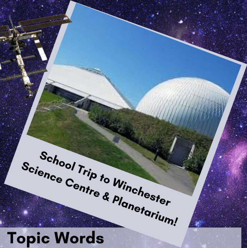
School Trip to Winchester Science Centre & Planetarium!